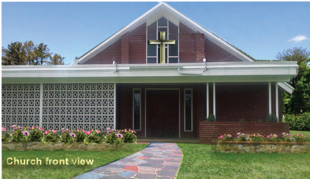
Church front view