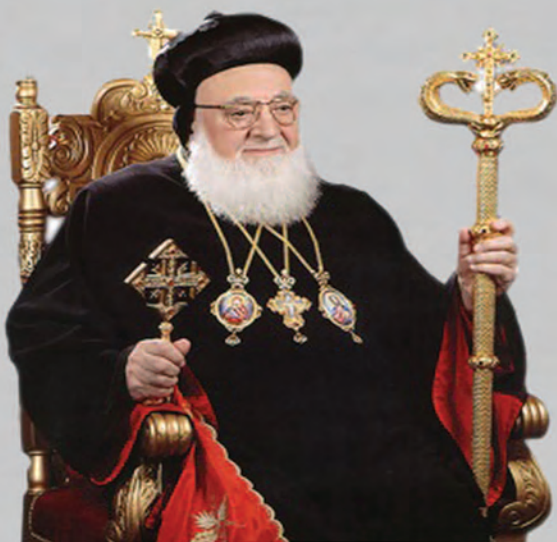
HIS HOLINESS MORAN MOR IGNATIUS ZAKKA I IWAS THE PATRIARCH OF ANTIOCH AND ALL THE EAST