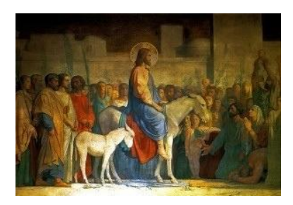
(Monday after the Sixth Sunday of lent to Hosanna is known as Hosanna Week. For 40th Friday and Lazarus' Saturday use special prayers for those days)